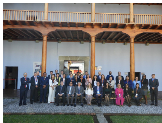
Officials participate in the 4th edition of the Executives Course.

In October, two face-to-face workshops were held in Antigua Guatemala, as part of the “Advanced Course on Tax and Customs Administration Management”, organized in conjunction with the IMF’s Fiscal Affairs Department and the IFS. This course had the support of strategic partners such as the National Open and Distance University (UNAD), the Inter-American Development Bank, the Global Trade Facilitation Program SECO-WCO, the Spanish Agency for International Development Cooperation, and the Inter-American Center of Tax Administrations. The objective was to provide managers with basic training to manage a modern tax or customs administration focused on promoting voluntary compliance, considering that strengthening the management function is crucial for developing these administrations.