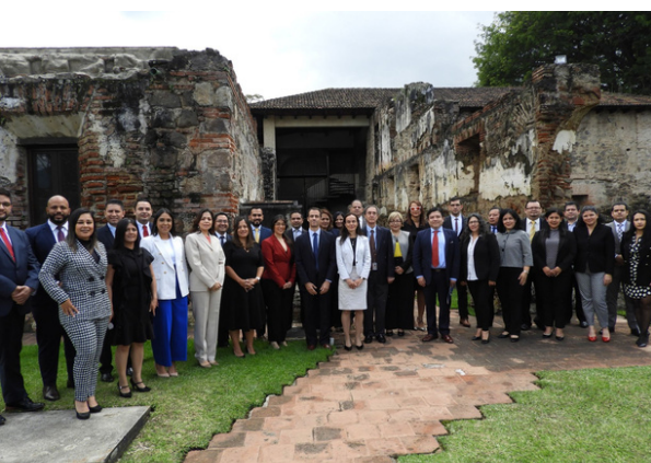
Seminar on "Management and Supervision of Credit Risk".