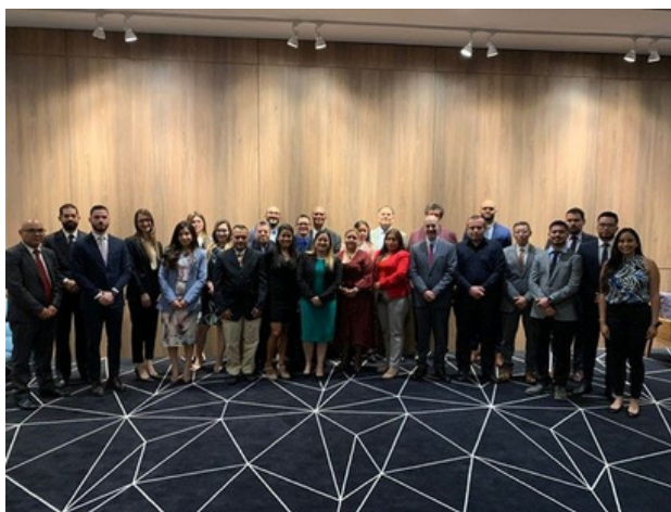
Inclusive Growth Course with the Institute for the Development of Capacities