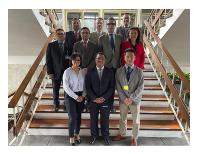
Mission of technical assistance with the Bank of Guatemala on liquidity forecasting using the statistical framework developed by MCM in June 2023.

During the present phase (2019-25), CAPTAC-DR has so far carried out three bilateral technical assistances to introduce the MCM framework described above. In terms of training, during the pandemic, a virtual workshop was conducted. In addition, the Center will hold in January 2024 an in-person workshop on liquidity forecasting with the region's central banks operating OMOs. The purpose of these activities is to continue the introduction or use of the statistical tools contained in this framework, and for central bank officials to develop their estimation capabilities.